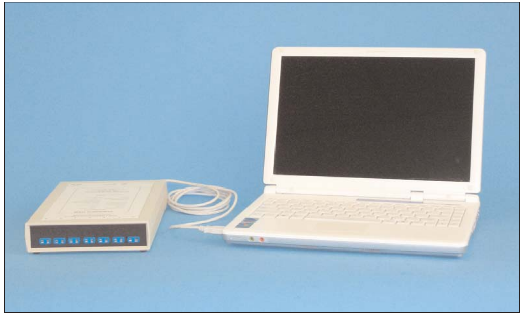
THERMES-Temperature Data Acquisition System with optional laptop computer

Physitemp's original Thermes high accuracy ISA based data acquisition system has been redesigned to create a more versatile USB model. The new system requires no internal connections to your computer and simply connects via an external USB port on your laptop or desktop computer. Two versions of the data acquisition system are available. The standard version, THERMES USB , is connected to your computer USB port. The wireless version - THERMES USB WFI , can be either directly connected to a USB port or, with the included wireless receiver, positioned up to 100 feet from the host computer.