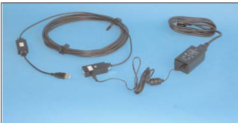
10 meter USB optically isolated interface with medical grade power supply

A 10 meter optical cable is available with built in transmitter and receiver to allow the THERMES USB to be operated in full optical isolation from the host computer. A medical grade isolated power supply is provided to power the optical transmitter and THERMES data acquisition system when used with this cable. Alternatively, a rechargeable Lithium Ion battery pack, the BP-1, is available to maintain the THERMES-USB or THERMES-USB WFI totally isolated from the AC supply.