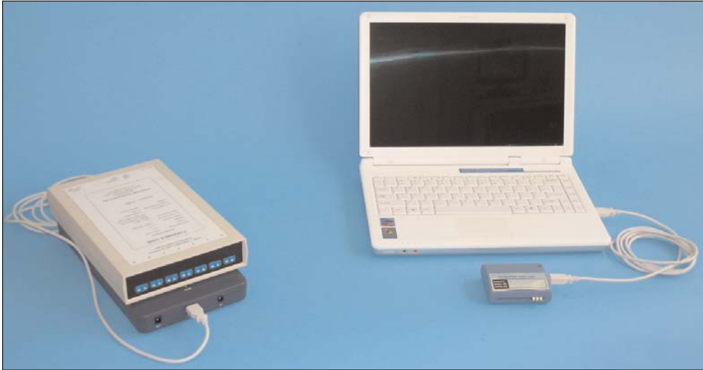
(left to right) THERMES-USB WFI - Wireless Temperature Data Acquisition System with optional battery pack, wireless receiver and optional laptop computer

The THERMES USB WFI is a Type T Thermocouple data acquisition system with a secure 2.4GHz wireless link to its host computer. Specifications for the device are the same as the THERMES USB except for its wireless capability. The THERMES USB WFI includes a wireless receiver that is connected to the host computer via a USB port. All communications between the host computer and THERMES pass through this device. The THERMES USB WFI may be connected directly to the host computer via a standard USB port (from which it also draws its power) or operated remotely from the BP-1 battery pack. A wall mounting USB power supply is also provided with THERMES USB WFI.